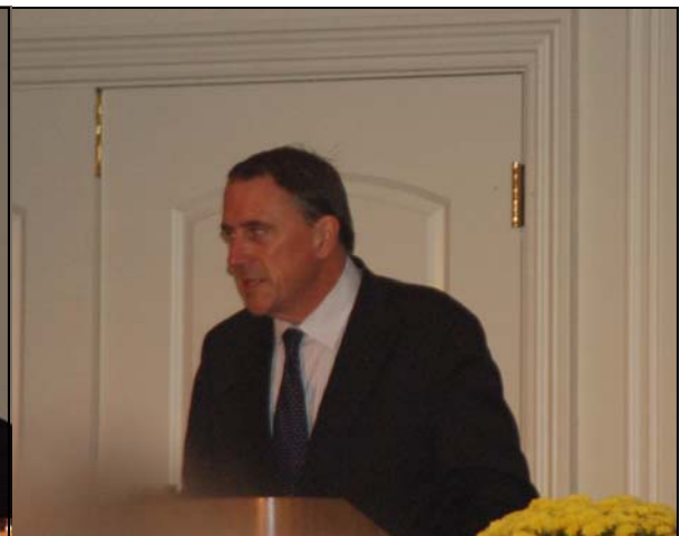
Former U.S. Ambassador Peter Galbraith discusses Foreign Policy to an attentive audience.