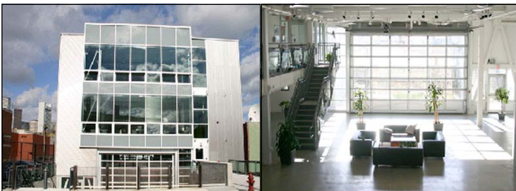
These exterior and interior photos show the LEED Platinum Artists for Humanity EpiCenter; an example of one of J.C. Cannistraro's green projects.

Moving forward, workshops on LEED for Existing Buildings will allow us to provide infrastructure upgrades on existing green buildings. We encourage our Project Managers to become LEED Accredited Professionals, and as a company, we will continue to provide a green outlook on our work.