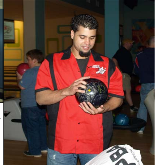
Red Sox reliever visits with Team Cannistraro